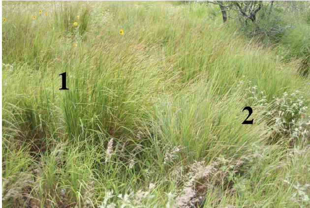
Two varieties of tanglehead in Jim Hogg County, TX

Interestingly, the wet year in 2010 allowed me to observe 2 distinct varieties of tanglehead growing in the same area in Jim Hogg County. The less common variety, “Leafy” tanglehead (#2 in picture) produces much more leaf material and is a lighter shade of green. The more common variety, “Stemmy” tanglehead (#1 in picture) produces tall and thin appearing plants with much more robust stem material and is a