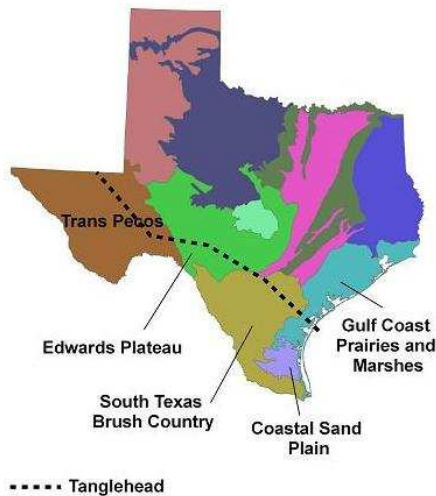
----- Tanglehead Ecoregions of Texas where tanglehead occurs and the Northeast tanglehead boundary

In Texas, Tanglehead is primarily distributed throughout the southern and western regions of the state which includes portions of the Trans-Pecos, Edwards Plateau, South Texas Brush Country, Coastal Sand Plain, and Gulf Coast Prairies and Marshes ecoregions. Tanglehead is widely considered to be native to the United States and to Texas. Other U.S. states which tanglehead occupies include New Mexico, Arizona, California, and Hawaii.