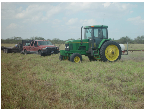
Tractor and sprayer

Imazapyr is a relatively expensive chemical and may only be economically feasible for small scale patch control of tanglehead. I am currently planning to initiate an efficacy experiment evaluating different rates of imazapyr to see if a low rate can be found that is effective on tanglehead while being more cost-effective for land owners. This may also make the herbicide more feasible to spray on larger scales.