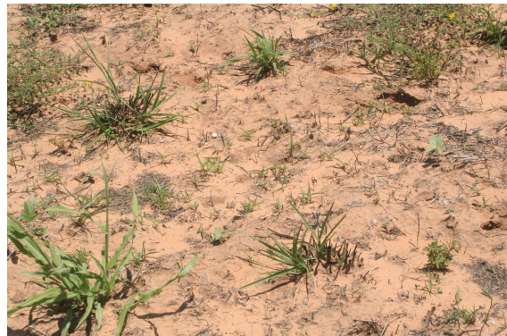
Tanglehead seedlings germinating after a winter fire

In a recently completed winter burning study in Jim Hogg County, results show that, when burned with no grazing, tanglehead increased 19.6% from February to July while on unburned areas, tanglehead increased only 6.4%. Of all the vegetation data collected, the most interesting result was the seedling response on burned areas which showed an average of 212 seedlings/m 2 while unburned areas averaged 0.4 seedlings/m 2 . This response has never been documented in the U.S. but is