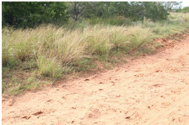
A typical soil occupied by dense tanglehead in South Texas

While tanglehead grows in various regions of Texas, it densely populates the Coastal Sand Plain ecoregion of South Texas, also known as the South Texas Sand Sheet. Within the tanglehead region of South Texas, the densest tanglehead occurs on the fine sandy-loam and loamy fine sand soils. These soils are found throughout Jim Hogg County, much of Duval County, and in portions of Starr, Hidalgo, Brooks, Kenedy, Kleberg, and Webb counties. Tanglehead will also occur on fine sand soils, but does not appear to grow densely or increase rapidly on them.